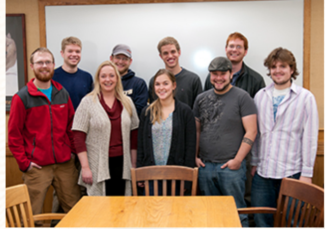
JOIN PHI ALPHA THETA: MSU'S HISTORY CLUB

Our students ask the historical questions to understand why the world is the way that it is and how they can change it for the better. While our students can explore history major and minor options, the skills they learn in our courses prepare them for careers in a wide variety of fields including business, law, government, international business, education, research, public history, historic preservation, and numerous other areas. Regardless of what career you choose, you will be able to think critically, write persuasively, consider a problem from multiple perspectives, and ask relevant questions – these are the intellectual skills that many employers demand.