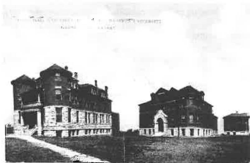
Ward Hall and Stanley Hall circa 1910. Western University, Kansas City, Kansas. Ward Hall built in 1881 was destroyed by fire in 1912. The University was closed in 1948 and Stanley Hall is no longer standing.