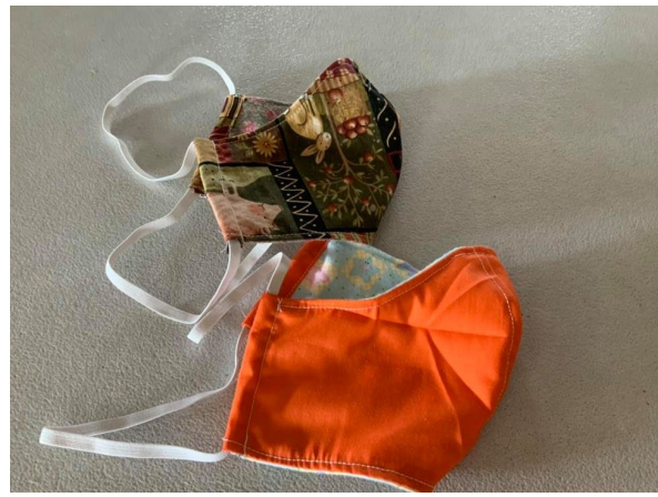
Examples of what homemade cloth COVID-19 masks can look like. Photos courtesy of Vicki Kultgen.

Please check out Liberty County's website for local updates on Covid-19 at http://co.liberty.mt.us/liberty-county-coronavirus-covid-19-information/ and Liberty County's Facebook page.