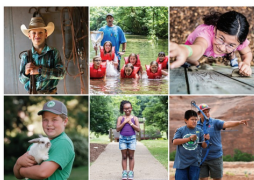
Montana youth are thriving in 4-H programs. 4-H offers a powerful connection to the community and the opportunity to gain employment skills that last a lifetime.